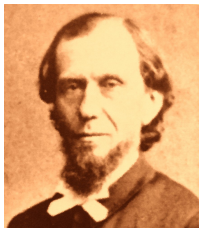
Andrew Murray 1828-1917

Fourthly. Whatever God receives back from us comes to Him in Heaven and gives Him infinite joy and happiness, as he sees His object has been attained. Let us come in the spirit of David, with the spirit of Jesus Christ in us. Let us pray our Consecration Prayer. And may the Blessed Spirit give each of us grace to think and to say the right thing, and to do what shall be pleasing in the Father's sight.